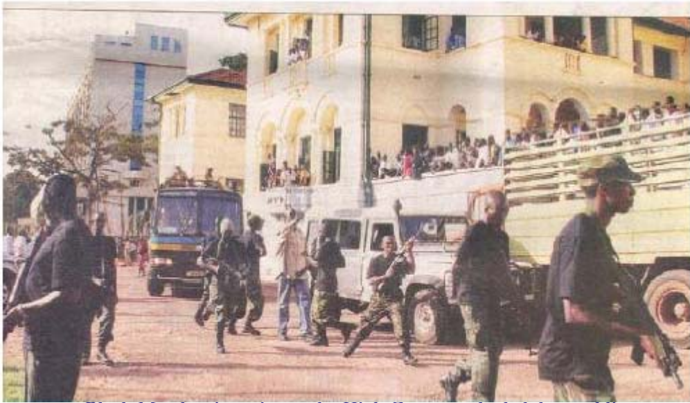
Black Mambas in action at the High Court, as the helpless public watches in utter confusion

Indeed, the following day on November 17 th , 2005, all the accused persons including Besigye were taken to Makindye and jointly charged in the GCM with the offence of Terrorism, 14 and in the alternative with being in Unlawful Possession of Firearms. 15 All the offences arose from the same facts as the treason and misprision of treason charges previously preferred against them in the High Court.