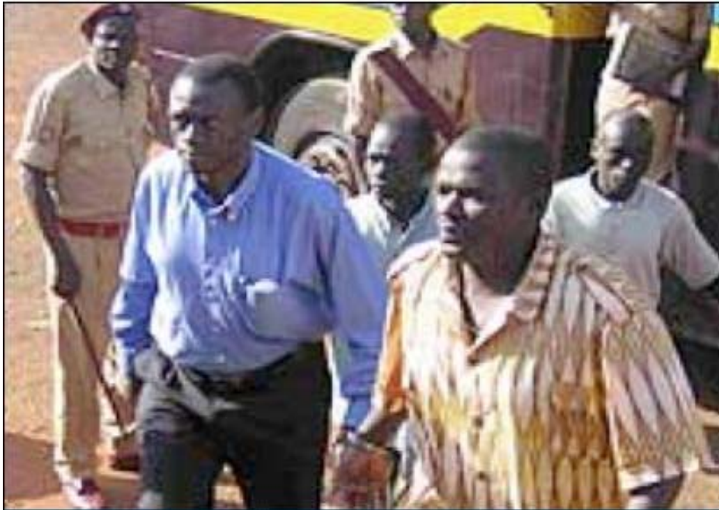
Dr. Kizza Besigye (in blue shirt) arriving at High Court in handcuffs to attend one of the court sessions

Performance at the GCM could and definitely is one way of evaluating an officer for promotional purposes and therefore leading to an increment in salary and other benefits. Lord Chief Justice Lamer in the Genereux case rightly observed that an officer's performance evaluation could potentially reflect his superior's satisfaction or dissatisfaction with his conduct at a court martial. Consequently, by granting or denying a salary increase or promotional prospects on the basis of a performance evaluation, the Executive through the High Command (the appointing authority) might effectively reward or punish an officer for his or her performance as a member of the GCM. This greatly undermines the independence of the military court.